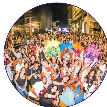
Salsa in the District $15,000