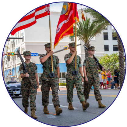
Clearwater Veterans Alliance Memorial Day Celebration $81,000