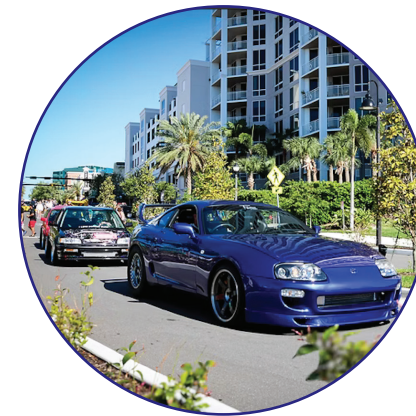
Summervibes Car Show $5,454