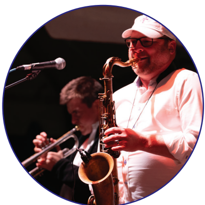
Clearwater Jazz Holiday $63,000

The Downtown Development Board Funded a variety of community events