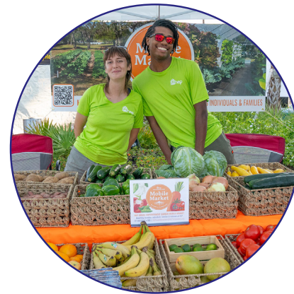
The Market Marie $7,240