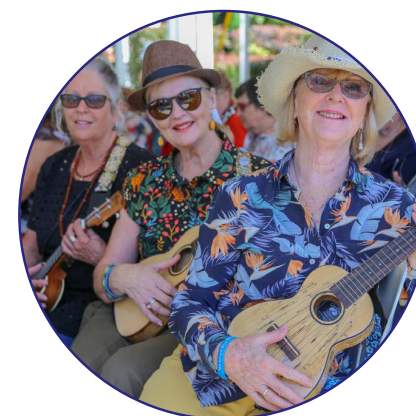
Tampa Bay Ukulele Festival $18,429