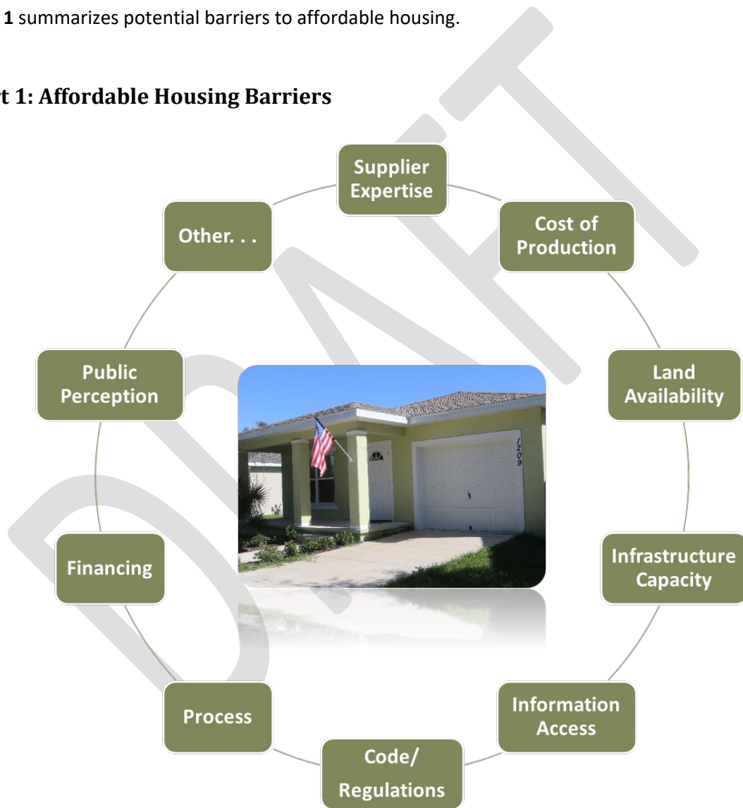
Chart 1: Affordable Housing Barriers

Chart 1 summarizes potential barriers to affordable housing.