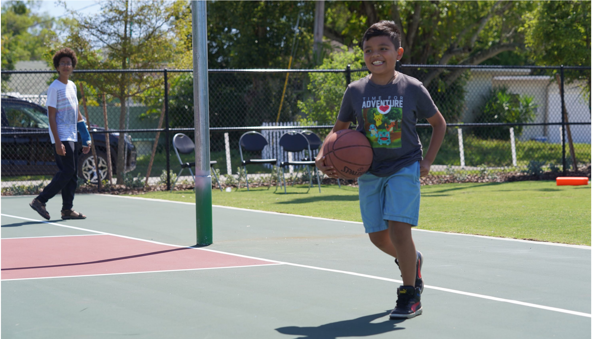
Children playing basketball at Belmont Park

Incorporate findings from the Parks and Recreation System Master Plan into the Comprehensive Plan by 2025.