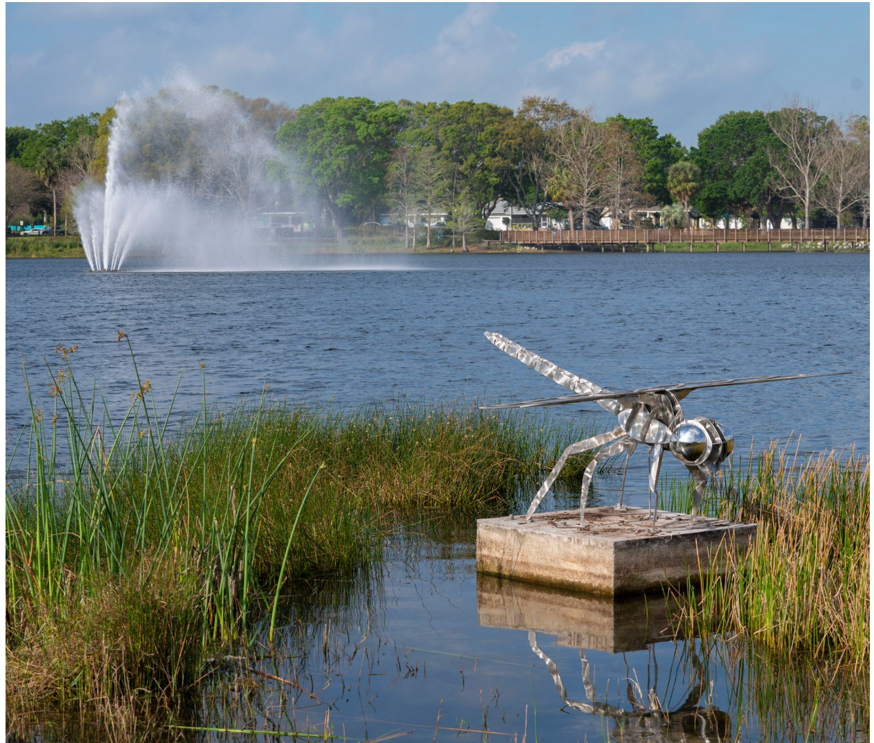
Crest Lake Park

Utilize the parks and recreation impact fee to improve open spaces and parks and recreation facilities and to create new trails.