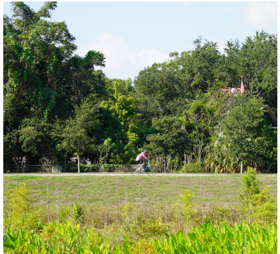
Bicyclist using the Ream Wilson Trail

Provide a reduced impact fee to incentivize the development of affordable housing.