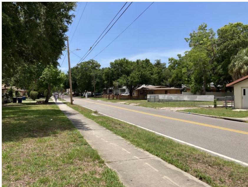
STREET SCENE LOOKING WEST BEYOND SUBJECT ON RIGHT