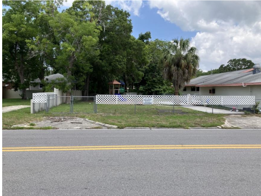
#918 INTERIOR SITE VIEW