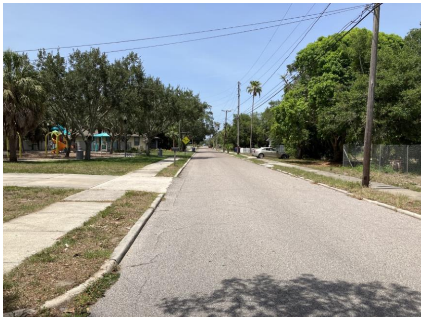
STREET SCENE LOOKING EAST BEYOND SUBJECT ON LEFT