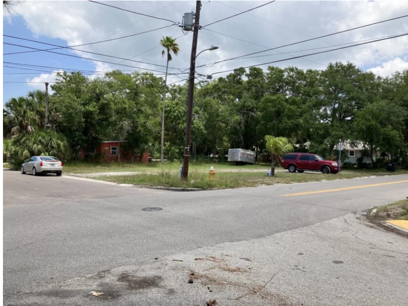
#900 CORNER SITE VIEW